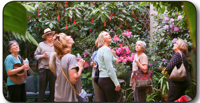
OLLI members in the "Architecture of Maybeck and Morgan" class on a field trip

L AID THE GROUNDWORK FOR A SUSTAINABLE future with a second $1 million gift from the Bernard Osher Foundation and a new administrative home called SSALL (Summer Sessions, Study Abroad and Lifelong Learning) that affirms OLLI's contribution to the University's mission of teaching, research and service