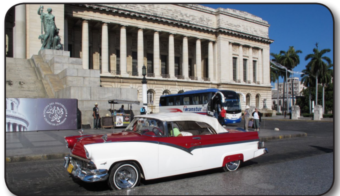
OLLI members traveled to Cuba in March 2012 in a collaborative program with Road Scholar