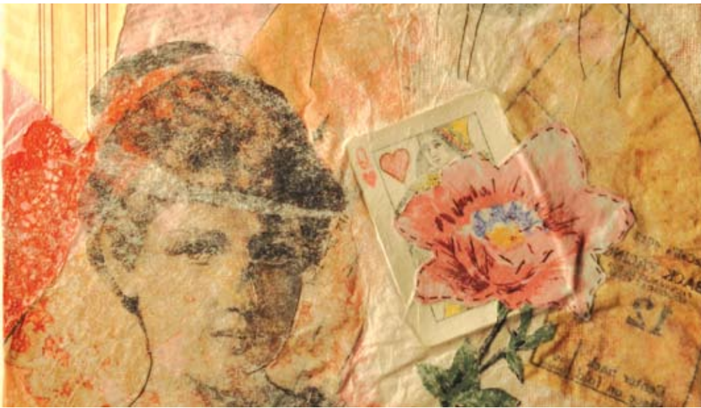
Mixed-media collage by Becky Brooks

See the centerfold for a map. Visit olli.berkeley.edu for reading lists and more class info.