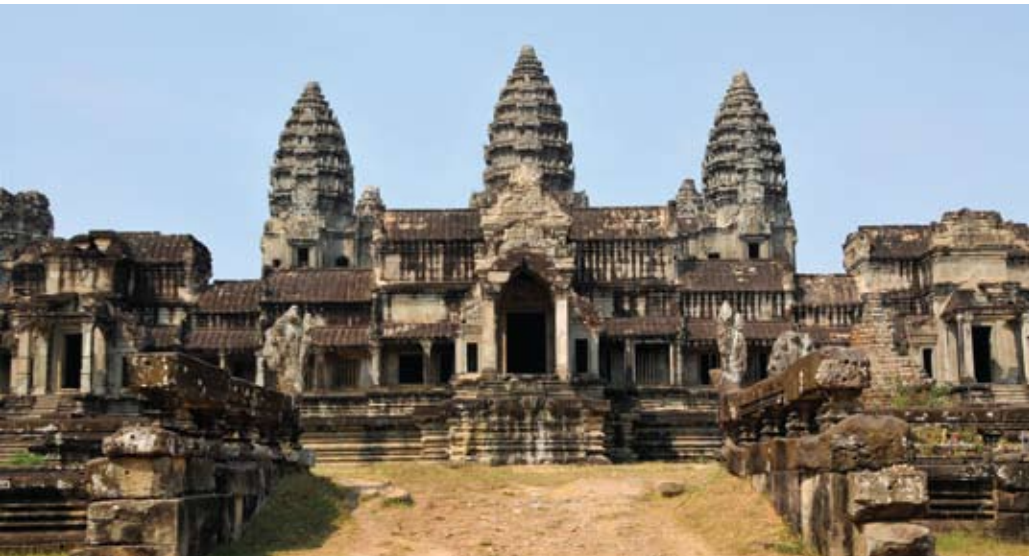
Angkor Wat temple.

See the centerfold for a map. Visit olli.berkeley.edu for reading lists and more class info.