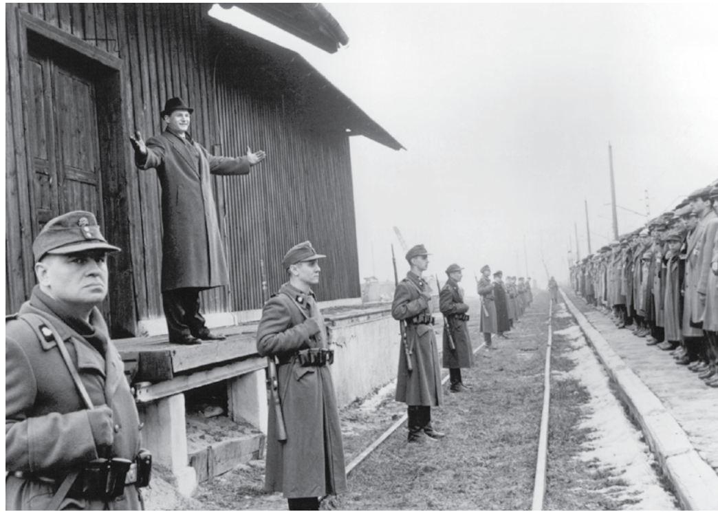
Film still of Schindler's List