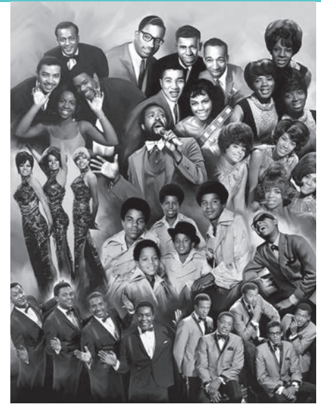
Left – by Getty Images. Right – Motown Legends by Wishum Gregory.

their aims, strategies, choices, and ethics. Examine perennial issues of nonfiction filmmaking, such as point of view, journalism versus activism, truth versus representation, the imperatives and conventions of narrative (i.e., storytelling), and aesthetic choices.