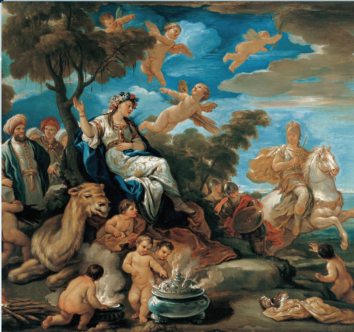
Image: Copy of "Series of the Four Parts of the World. Asia" Luca Giordano, 1687–89

Encore courses are pre-recorded courses that were provided live in a previous term. Course videos are posted on the first day of the term. Encore course listings can be found on page 10.